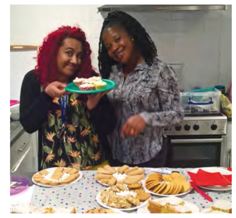
Create London staff showing off display of homemade and hub made cakes