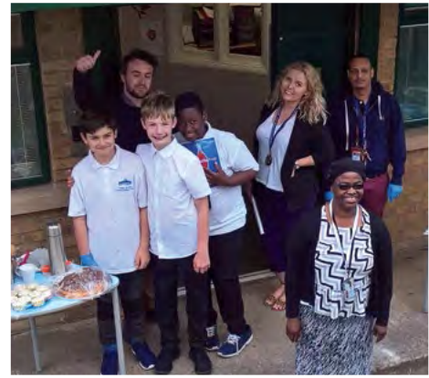
Create London staff and students having fun selling cakes, coffees and teas to members of the community