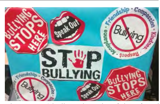
The EFS anti-bullying letterbox (above) and business cards (below)