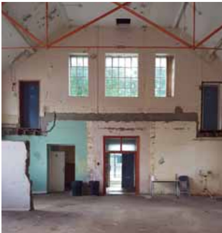
The inside of the church as it was

Those of you who have visited Stratford Marsh will be aware of the pre-existing church that stands to the left of the school. This latest phase of redevelopment will see the church hall transformed into a new part of the school.