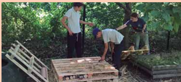
Staff and pupils at EFS Witham making good use of some old pallets (and the lovely summer weather!) to build a bug hotel in their forest school

Both primary and secondary children at the school have enjoyed working with the Wildlife Trust over the past year in all weathers. They've helped dig and make a fedge (a cross between a fence and a hedge), which has broken up the school field nicely and is now growing well. Treasure digs (holes) are used to dig for buried treasure. There are hammocks and rope swings which they enjoy playing on. Vegetable trugs are used to grow pupils' own herbs and vegetables, which they cook with, while a log circle around the fire pit is used every week to cook different things, such as pizzas, pancakes, popcorn, marshmallows, fruit, etc. This year they've made a den out of willow trees, called a willowdome and have planted three fruit trees - apple, pear and plum - having tasted all the fruit that the trees produce.