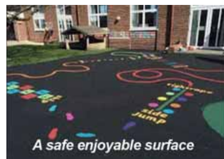
A safe enjoyable surface

Find out more: cheryl.rutter@tces.org.uk