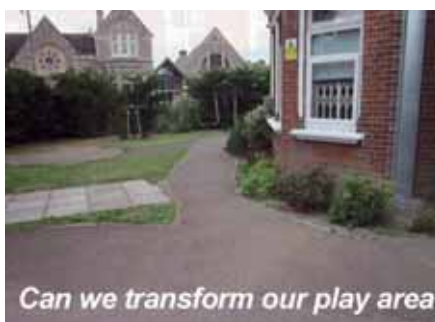
Can we transform our play area

agenda – 'a safe and friendly outdoor environment for play and social time within our school.'