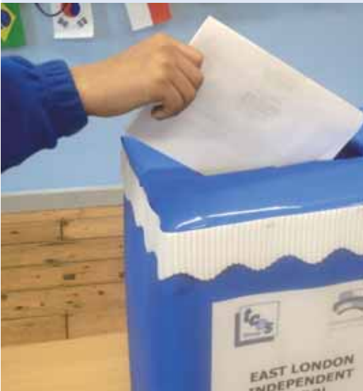
Voting at ELIS Custom House