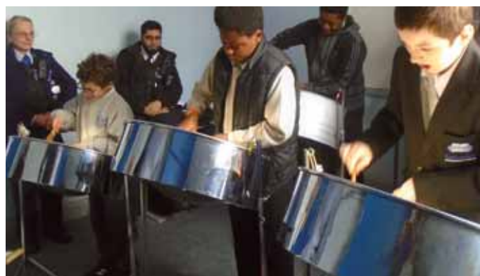
Pupils performing their steel pan skills for the community police